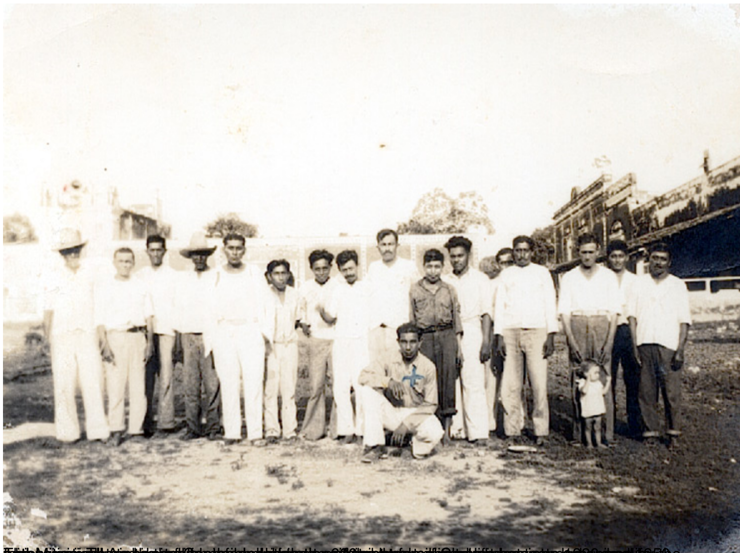
This is a group of men and a child standing in front of a building, likely a school or government building, in the early 20th century. The men are dressed in light-colored shirts and trousers, some wearing hats. The child is standing on the right side of the group. The building in the background has a balcony and is surrounded by trees.