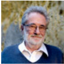
Founder Director Pedro Meyer

pedro@zonezero.com Pedro Meyer is one of the pioneers and most recognized representatives of contemporary art.